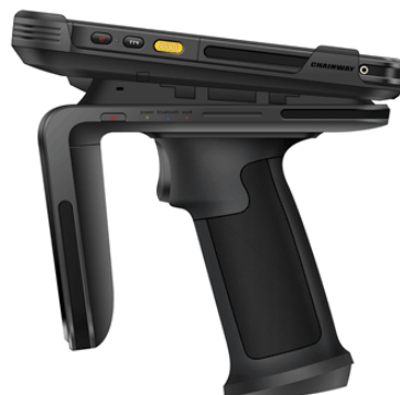
UHF Sled Reader